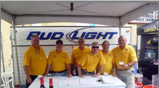
BREA LIONS MAN THE BEER & WINE GARDEN BOOTH AT THE FATHER'S DAY CRUISIN' CAR SHOW ON THE BREA BIRCH STREET PROMENADE

There is work to be done, goals to be met, and people to serve. Here's to another great Lions year.