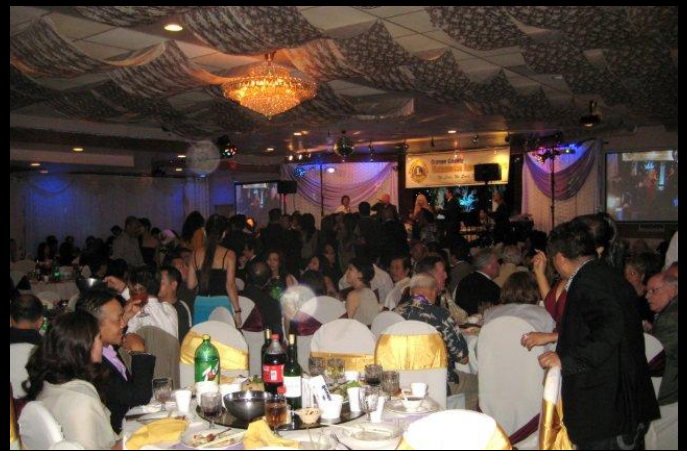
400 GUESTS, A DELICIOUS 8 COURSE MEAL, SUCCESSFUL AUCTION AND GREAT ENTERTAINMENT ALL ADDS UP TO WONDERFUL NIGHT TO BRING IN OUR NEWEST LIONS CLUB