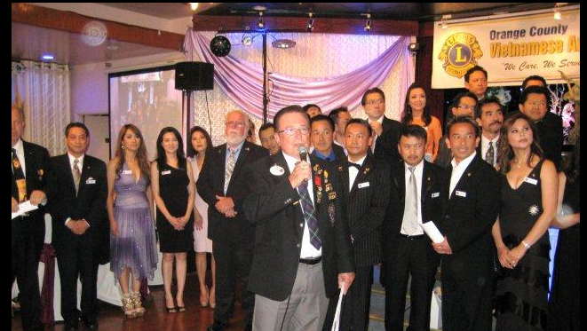
GOV. NORM AND NEW CLUB OC VA LIONS