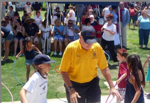
AND JUDGED THE HULA HOOP CONTEST AT THE BREA 4TH OF JULY COUNTY FAIR