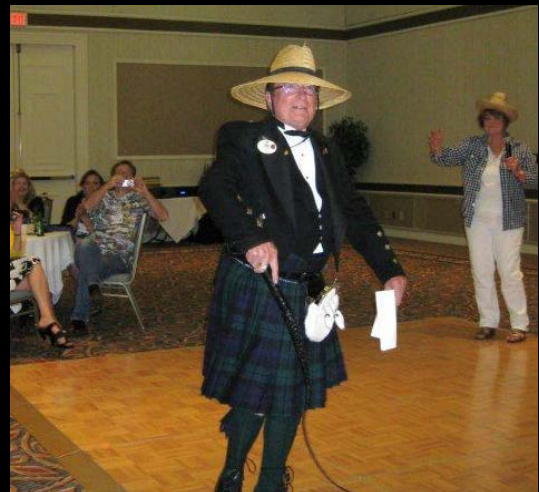
Governor Norm still crackin' the whip