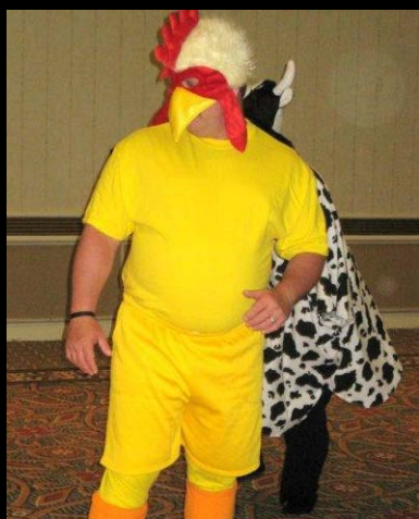
CHARLIE THE CHICKEN