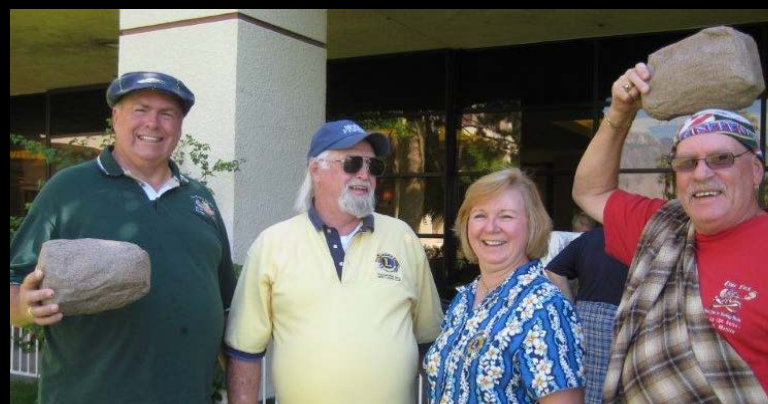
THERE WERE GAMES!