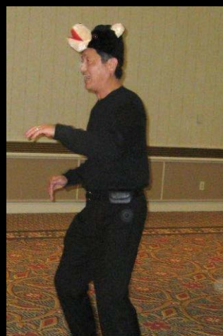
BEN THE BEAR