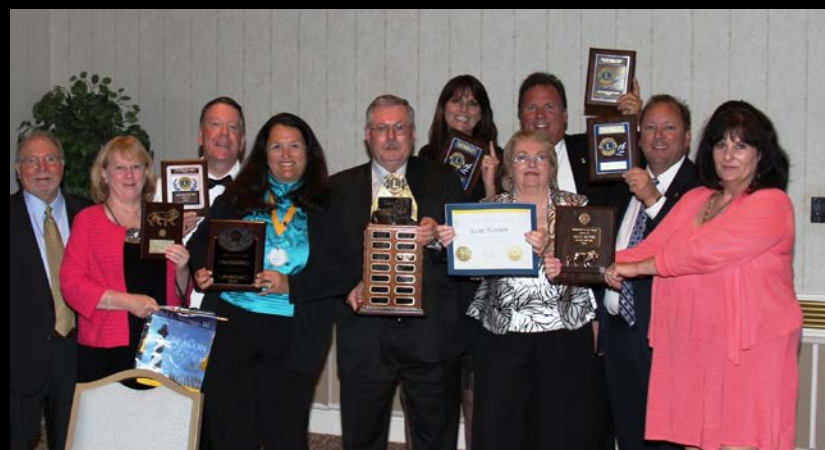
SEAL BEACH SHOWS THEIR IMPRESSIVE ARRAY OF WINS