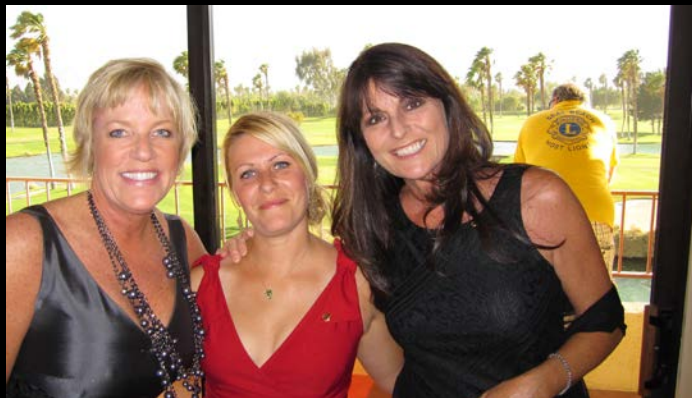
SEAL BEACH BEAUTIES .....