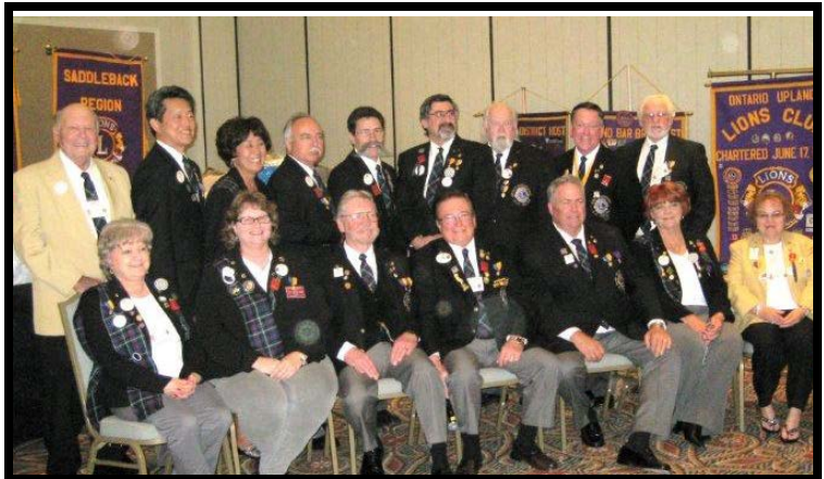
A BANNER YEAR FOR THE 2010-2011 CABINET