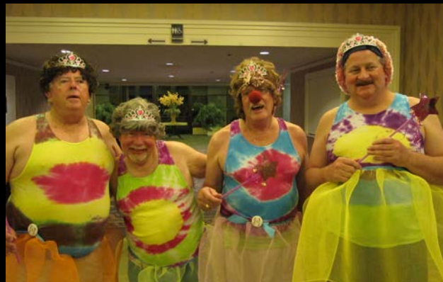
..... AND THE BEASTS