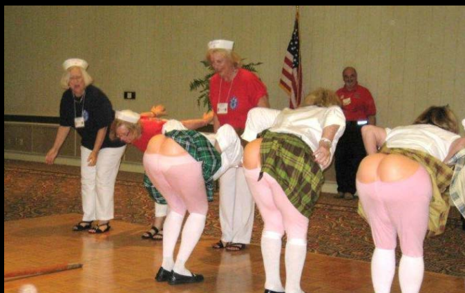
THERE ARE NO WORDS