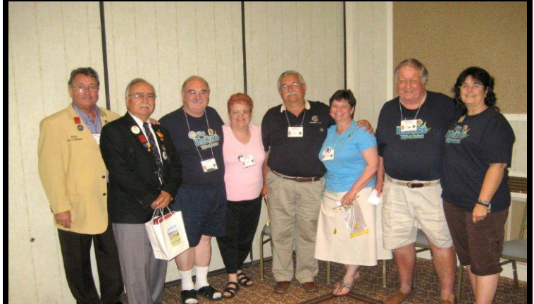
GREAT JOB DONE BY THE CONVENTION COMMITTEE