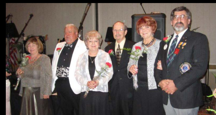
THE GRAND MARCH