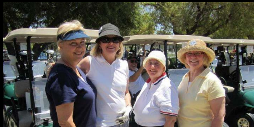
THE LADIES ENJOYED GOLF