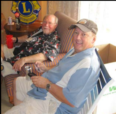
SEAL BEACH & LA HABRA SHARE A HOSPITALITY ROOM