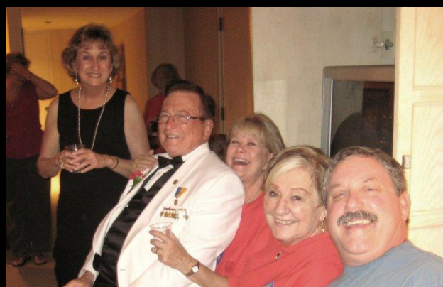
THURSDAY NIGHT FUN!