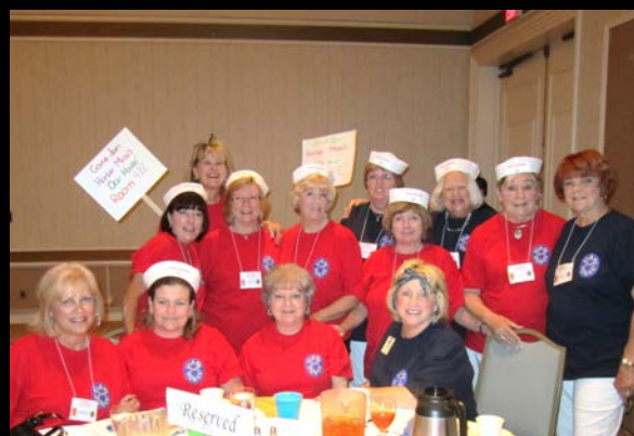
HUNTINGTON BEACH HOST AND HARBOR MESA CAME IN BIG NUMBERS