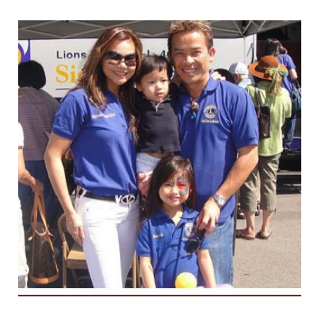
IT'S A FAMILY AFFAIR