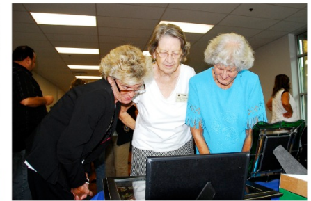
Inspecting the district pin collection and other prizes for the Governor's Fundraiser