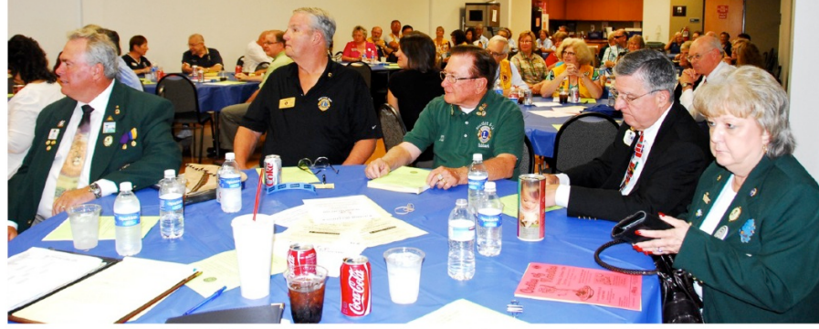
Foothill Region Lions and guests listen to the speakers.