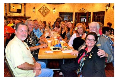
Newport Beach Hawaiian Lions had the most members in attendance.