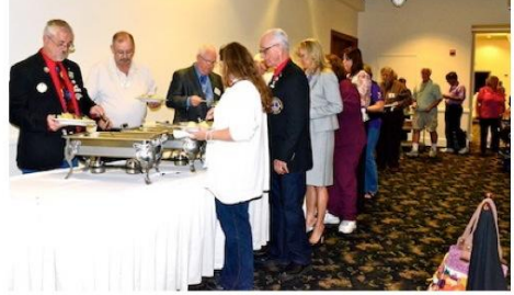
Lions line up for the buffet at the region meeting at the Westridge Golf Club.