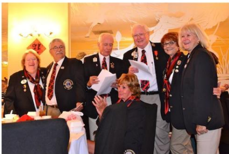
Cabinet sings at Chinese American Lions visitation.