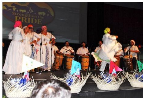
Puerto Rican music and dancing entertained the Lions.