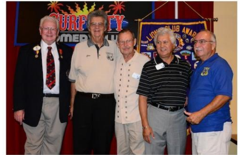
Huntington Beach Host Lions New Members Induction