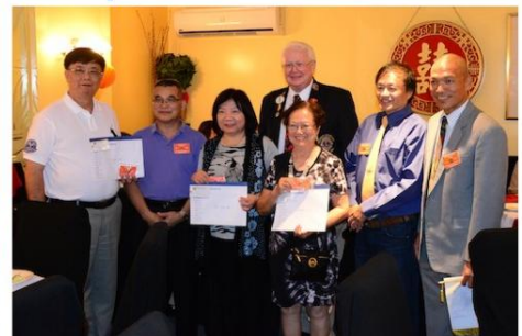
Chinese American New Members Induction