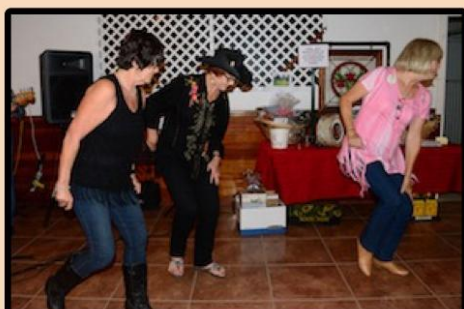
Harbor Mesa shows its line dancing prowess.