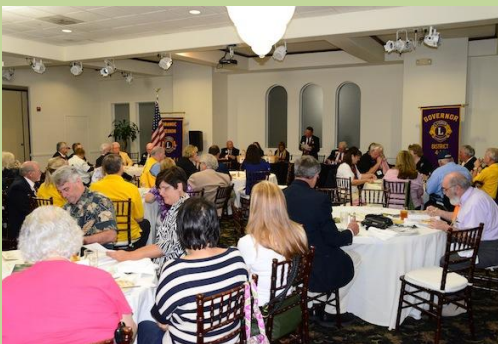
The Orange Region had a full house in attendance.