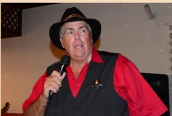
PDG PJ leads Fireball toast.