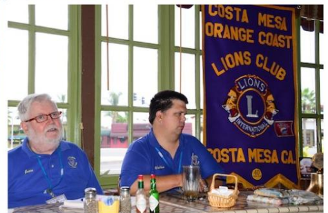
Costa Mesa Orange Coast Lions head table