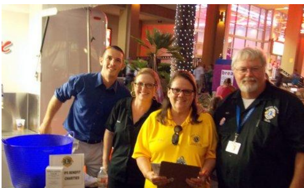
Brea Lions run the Beer & Wine Garden Booth at the Brea Jazz Festival

CONVENTION REGISTRATION FORM AVAILABLE AT: http://convention.md4lions.org/