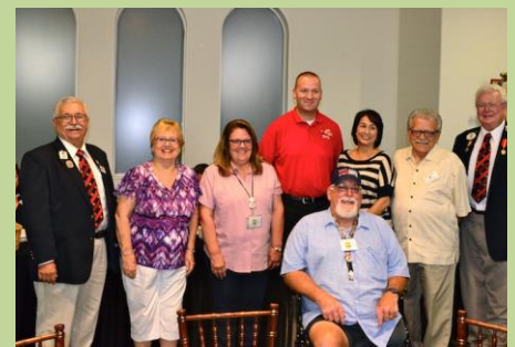
Orange Region 1 st Timers