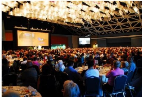
Lions gather in the banquet hall for food, motivation and entertainment.