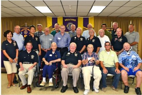
Garden Grove Host Lions with District Cabinet at Governor's Visitation