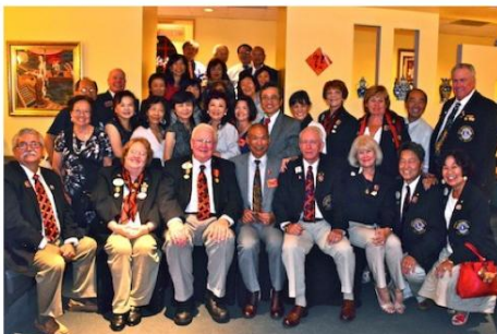
Chinese American of Orange County Lions with Governor and cabinet