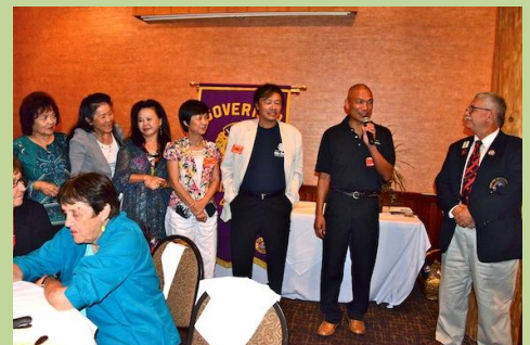
Saddleback 1 st Timers