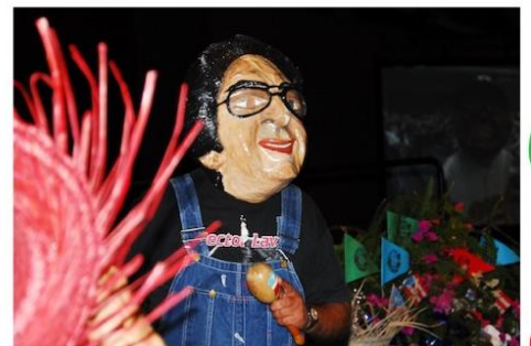
One of the "Big Head" characters during the entertainment