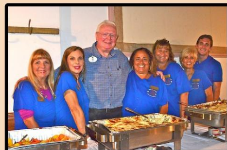
Newport Hawaiian Lions serve the delicious lasagna dinner.