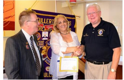
Fullerton Host Lions New Member Induction