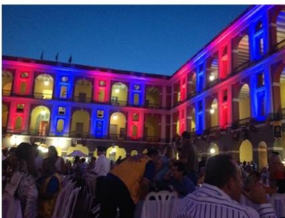
Festival at Antiguo Cuartel de Ballaja