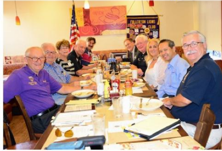
Fullerton Host Lions enjoy breakfast at visitation.