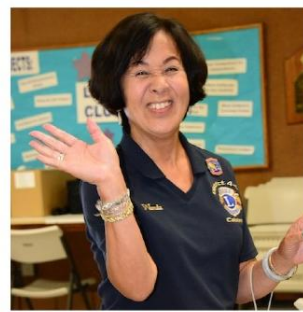
District Photographer Wanda Tanaka