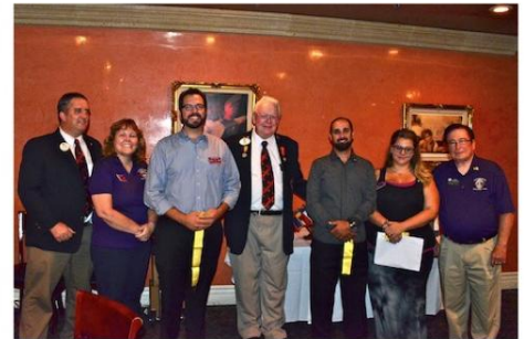
Cucamonga District Host New Member Induction