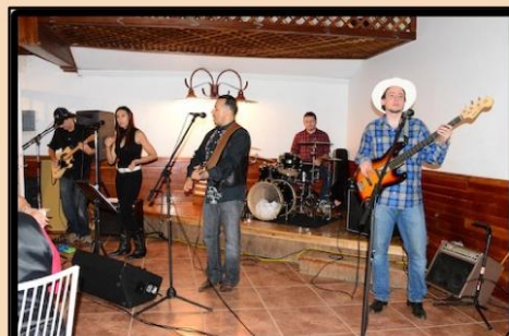
The band plays music for dancing and enjoyment.