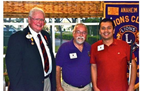
Anaheim Lions New Member Induction