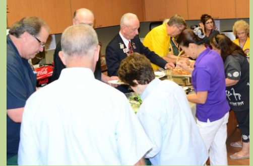
Foothill lines up for grub