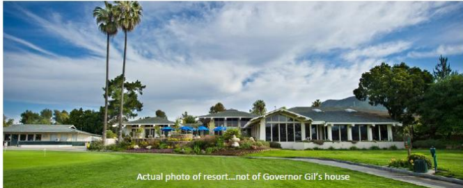
Actual photo of resort...not of Governor Gil's house

(Not to be confused with the Pala Casino Resort)