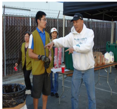
A beautiful day for volunteering!