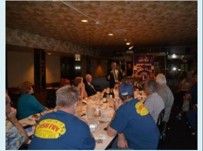
Costa Mesa Newport Harbor Lions