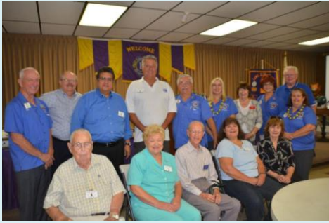
Garden Grove Host Lions