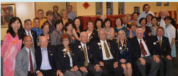
Chinese American Lions