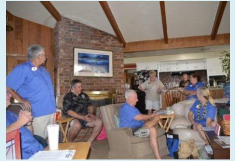
Cucamonga District Host Lions