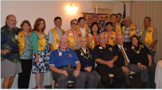
Diamond Bar Breakfast Lions