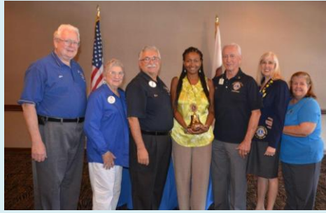
Pomona Host Lions