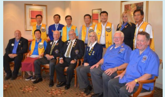
Korean American Lions