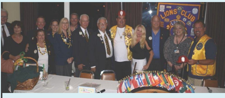
Seal Beach Lions