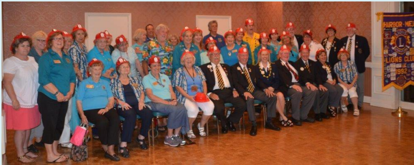
Harbor Mesa Lions