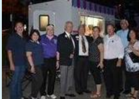
Chino Valley Lions