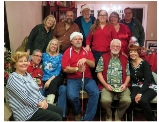
Saddleback Region Cabinet Members and Friends celebrate the season at the Cabinet Christmas Party