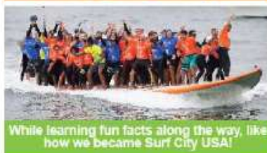
While learning fun facts along the way, like how we became Surf City USA!