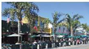
Visiting our favorite Restaurants, WineBars & Ice Creamery's