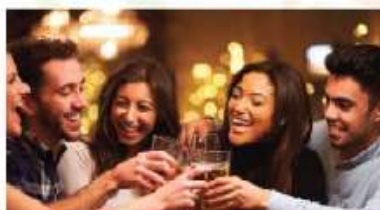
We'll Walk, Wine & Dine you through Downtown Huntington Beach