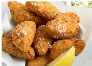
Crispy Fried Artichokes