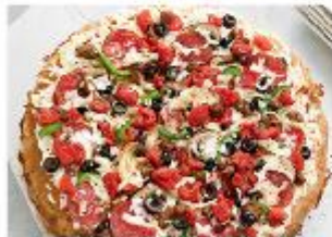
BJ's Favorite Deep Dish Pizza

Valid for dine in or take out. Not valid towards alcoholic beverages or Happy Hour specials. Please do not distribute flyers on-site during the event. Flyers must be printed and presented to the server.