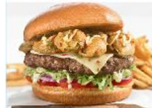
Crispy Jalapeño Burger