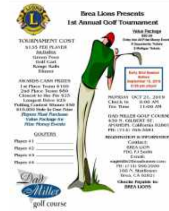
Brea Golf Tournament Click here for flyer

Click on links below to view and download PDF.