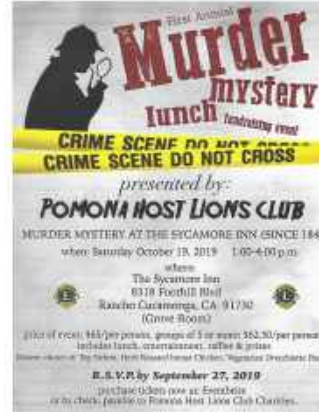
Pomona Host Lions Murder Mystery Click here for flyer