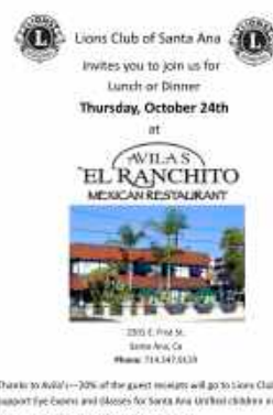
Santa Ana Lions Fundraiser