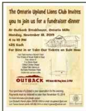
Ontario-Upland Lions Click here for flyer