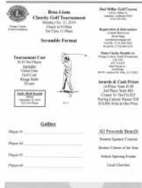
Brea Golf Tournament