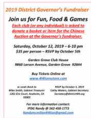
Governor's Fundraiser Click here for flyer