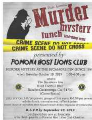
Pomona Host Lions Murder Mystery Click here for flyer