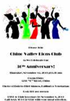
Chino Valley Lions Click here for flyer