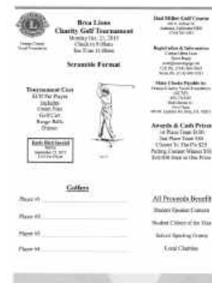
Brea Golf Tournament Click here for flyer

Click on links below to view and download PDF.