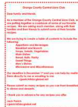
OC Central Lions Click here for flyer

Click on links below to view and download PDF.