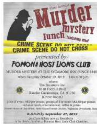
Pomona Host Lions