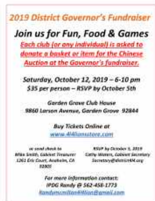
Governor's Fundraiser Click here for flyer