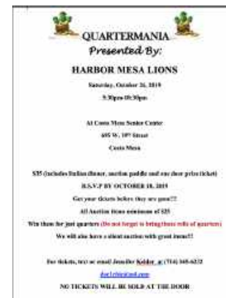
Harbor Mesa Lions Quattermania