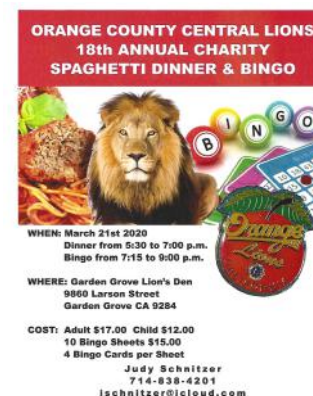
OC Central Lions Click here for flyer

Click on links below to view and download PDF.