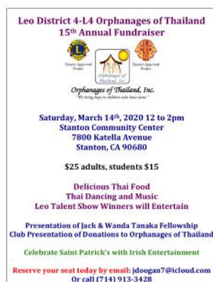
Orphanages of Thailand Fundraiser Click here for flyer