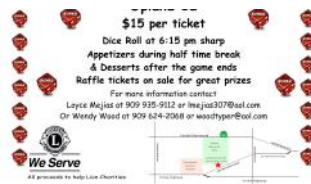
Ontario Upland Bunco Click here for flyer