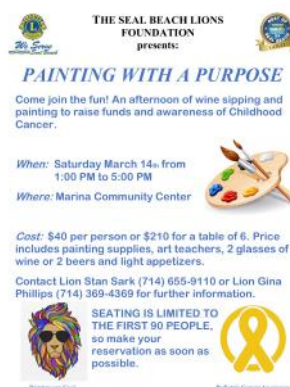
Seal Beach Lions Click here for flyer