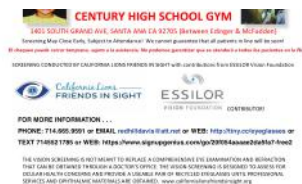
Santa Ana CLFIS Vision Screening Click here for flyer