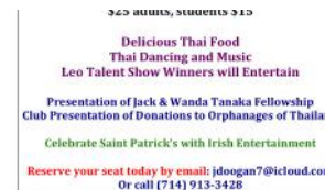
Orphanages of Thailand Fundraiser Click here for flyer

Click on links below to view and download PDF.